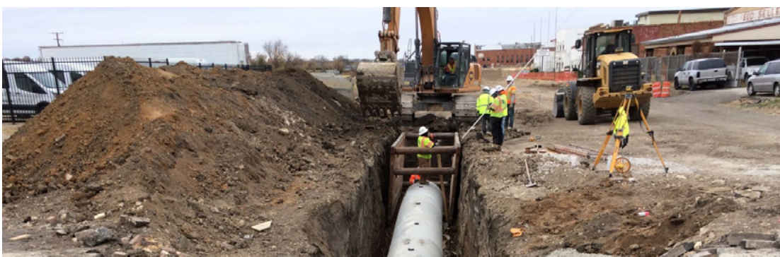
Construction still moving forward: Storm sewer being constructed north from the new manhole at NE 7th and Main Streets.