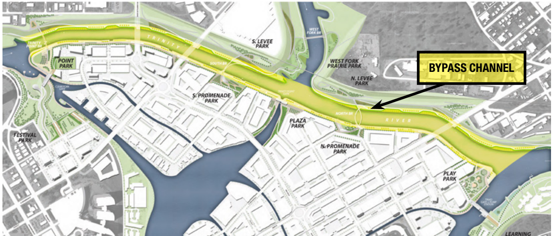
Pictured above 1.5 mile bypass channel, one component of the flood control infrastructure project.

DO YOUR HOMEWORK, DON'T BYPASS LEARNING ABOUT THE BIDDING PROCESS.