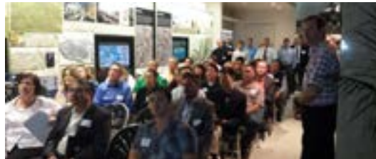
Over 75 vendors attended a bridge roundtable event held at the TRV Education Center on February 19, 2014 to learn about the upcoming Panther Island bridge construction and to network with subs and primes