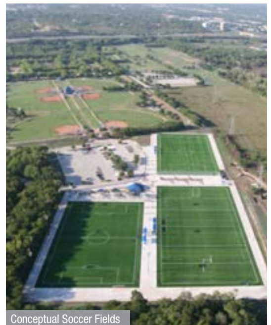
Conceptual Soccer Fields