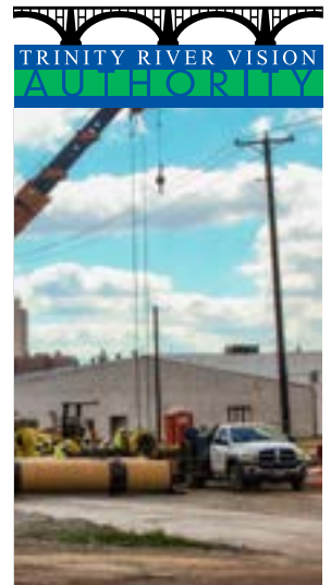
Utility relocation work off North Main St.