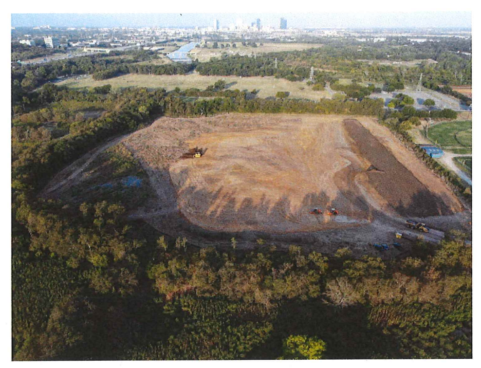
(Construction progress at Gateway Park Site I)

Construction work for the three bridges continued with the pouring of the V-piers on Main, Henderson and White Settlement and work on the superstructure on White Settlement.