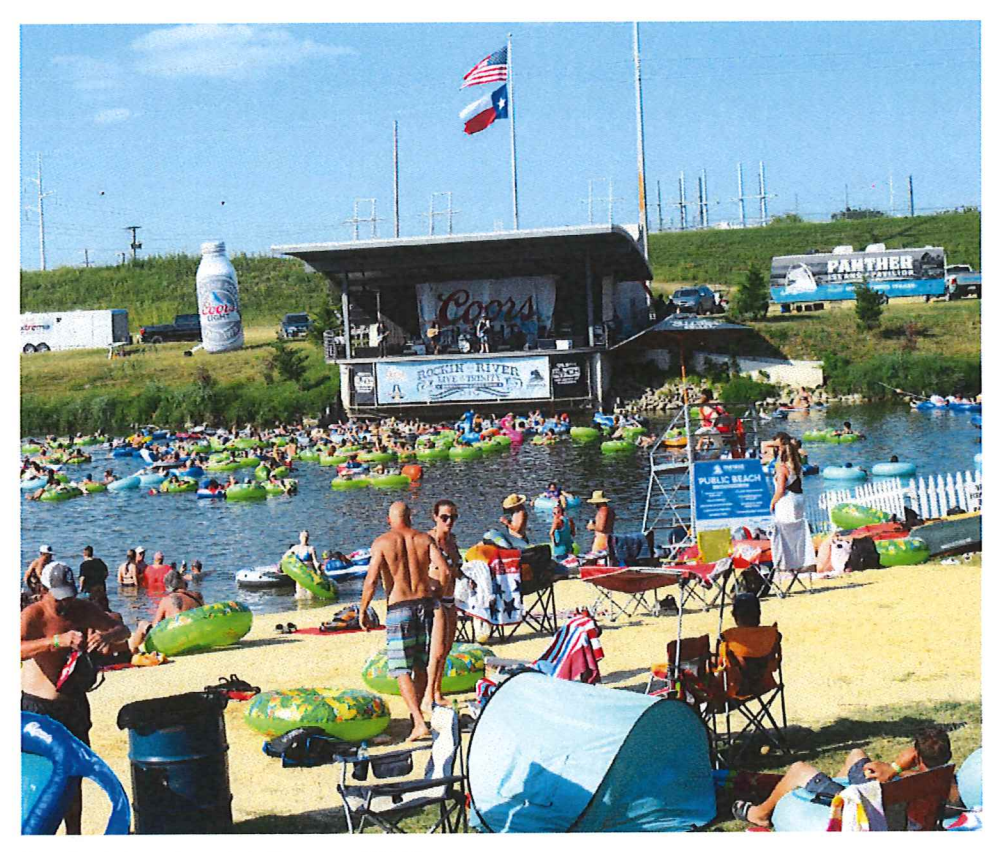
(Rockin' the River July/August 2019)

Additionally, at the confluence of the Clear Fork and West Fork (Panther Island Pavilion), where the urban lake will be created, staff produced Rockin' the River Tubing and Music series, the Sunday Funday series, and Oktoberfest Fort Worth as part of the Panther Island programming initiatives. These events promote the river as a recreational area for the community, and brought approximately 38,000 attendees to Panther Island Pavilion during fiscal year 2019. Panther Island Ice, a seasonal outdoor ice rink located at Coyote Drive In, brought an additional 40,000 attendees.