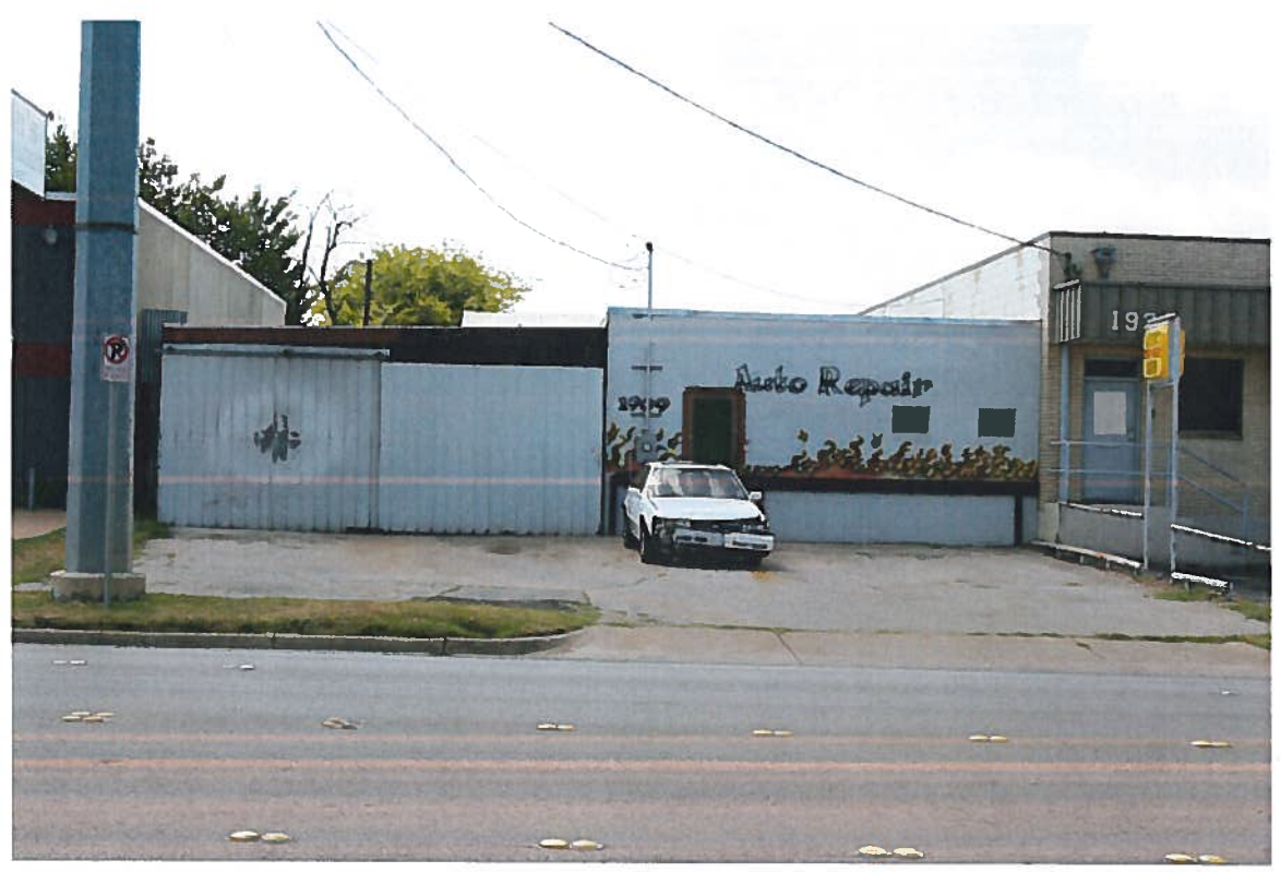
(The 100 block of White Settlement businesses before demolition)