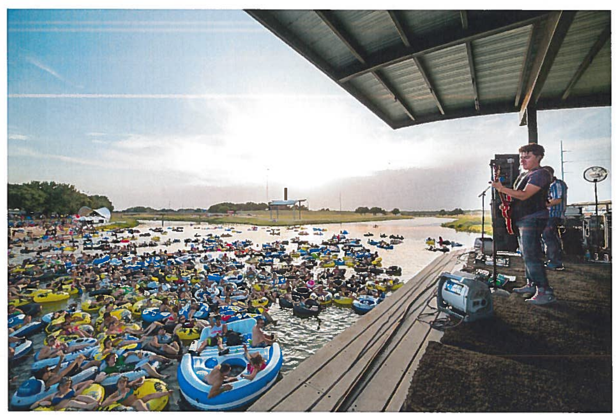
(Johnny Cooper Band, August 8, 2013 at Rockin' the River)

Additionally, at the confluence of the Clear Fork and West Fork (Panther Island Pavilion), where the urban lake will be created, TRVA held the Rocking the River event series. This event promotes the river as a recreational area for the community, and had an average estimate of 1,500 people attending each of the events. Fort Worth Fourth drew a crowd of approximately 73,000 people.