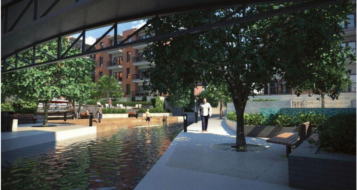
(Rendering of canal walkways)

Additionally, at the confluence of the Clear Fork and West Fork (Panther Island Pavilion), where the urban lake will be created, TRVA held Panther Island Ice, the Rocking the River event series, the Sunday Funday series, and Oktoberfest. These events promote the river as a recreational area for the community. The events brought approximately 66,000 attendees to Panther Island Pavilion in the 2016 fiscal year.