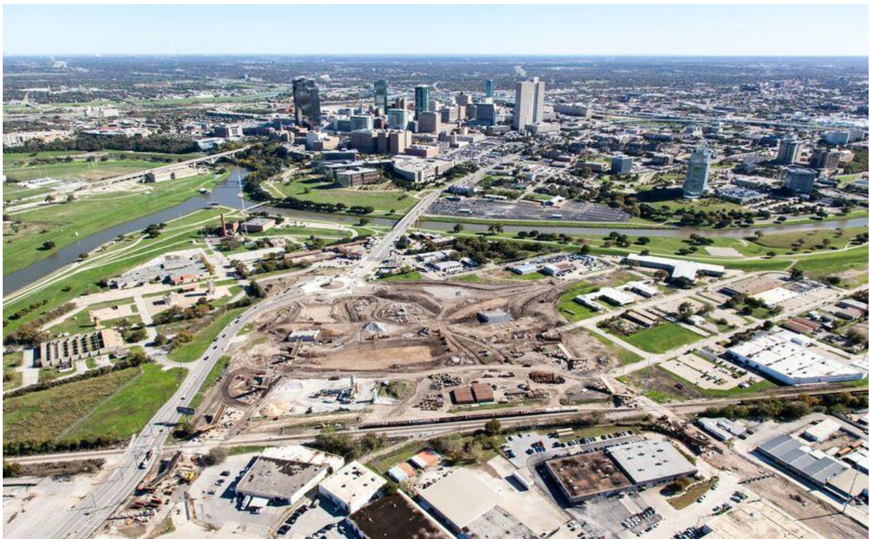
(TRVA bridge construction progress)

The public portion of the Central City Project is a cooperative effort financially sponsored by the Tarrant Regional Water District (the "District"), the City of Fort Worth, Tarrant County, the USACE, and the Texas Department of Transportation.