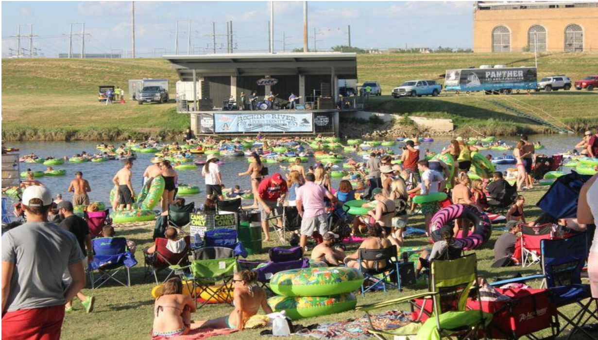
(June 23, 2016 at Rockin' the River)

Additionally, at the confluence of the Clear Fork and West Fork (Panther Island Pavilion), where the urban lake will be created, TRVA held Panther Island Ice, the Rocking the River event series, the Sunday Funday series, and Oktoberfest. These events promote the river as a recreational area for the community. The events brought approximately 66,000 attendees to Panther Island Pavilion in the 2016 fiscal year.